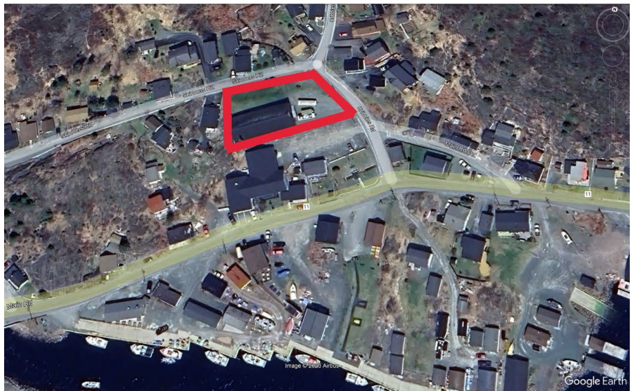
Figure 2. St. Joseph's Church Property, Cribbies Road

The property on which the church is located is 0.41 acres, bound by Skinners Hill Road along the north