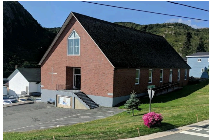
Figure 1. St. Joseph's Church

The subject of this amendment is the St. Joseph's church property. The property was among a number of properties belonging to the Roman Catholic Episcopal Corporation of St. John's included in a March, 2022 notice of sale which was part of an effort to resolve an archdiocesan bankruptcy filing and order to compensate victims of sexual abuse at the Mount Cashel orphanage.